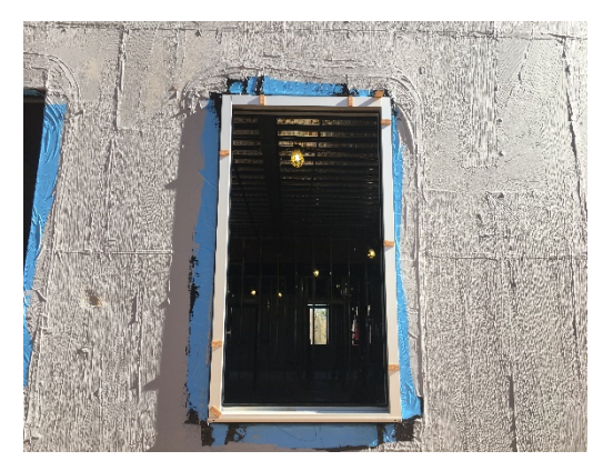
New Addition Window Framing & AWB