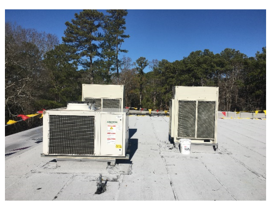
Relocated RTU Units