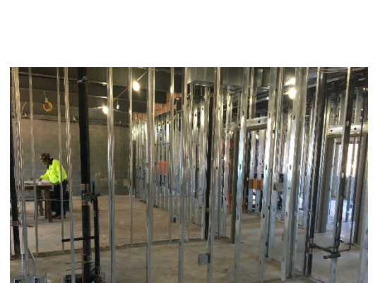
New Addition In Wall MEP