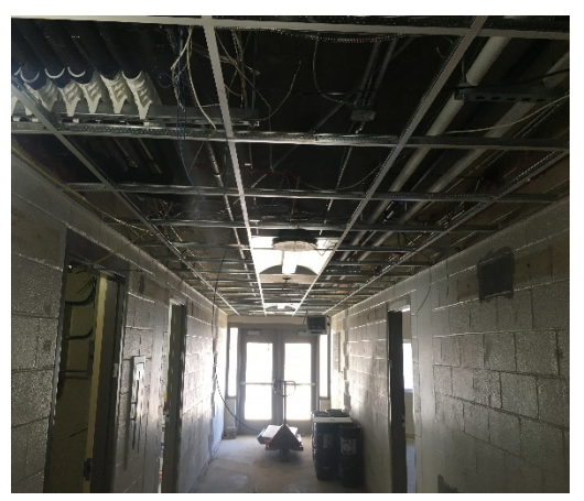
Building #2032 Ceiling Grid Installation