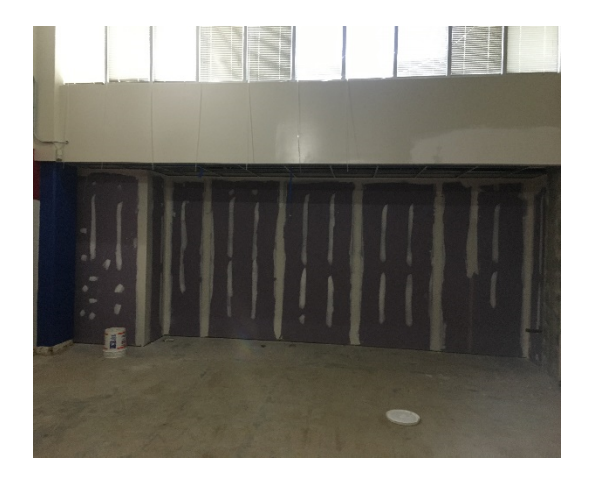
Building #2032 Drywall Tape & Finish